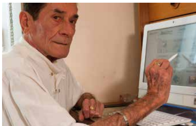
Direction de la Communication CG Bas-Rhin / mars 2013 / Photos : Denis Guichot/CG67

In 2010 the Council launched a call for projects. Seven innovation projects were selected and tested over the period 2010-2012, with an overall budget of €2.6 million. Two projects received additional funding from the European Agricultural Fund for Rural Development. The Council and its partners have developed an expertise on